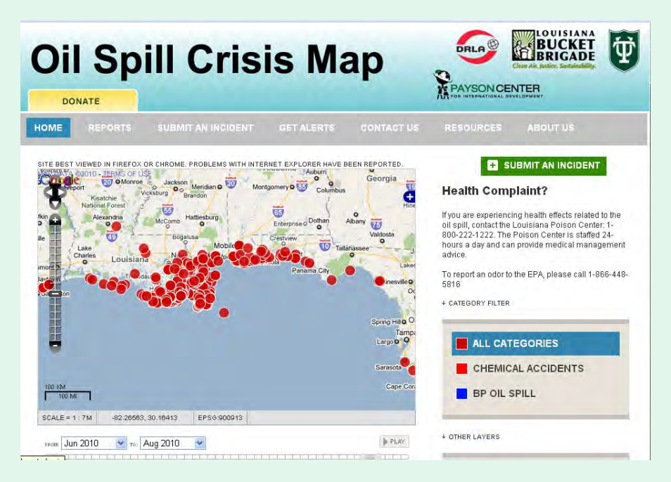
LA Bucket Brigade - Oil Spill Crisis Map